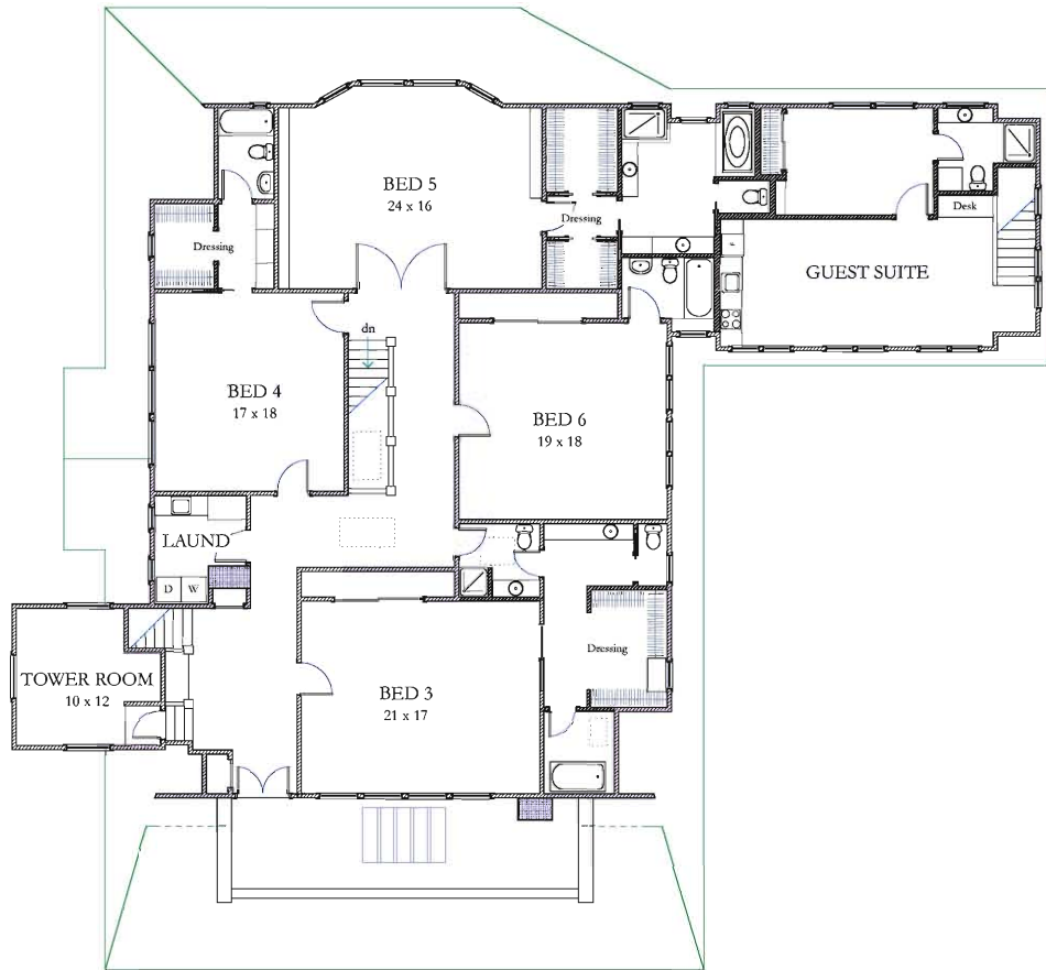
Second Floor 3700 s.f. ±